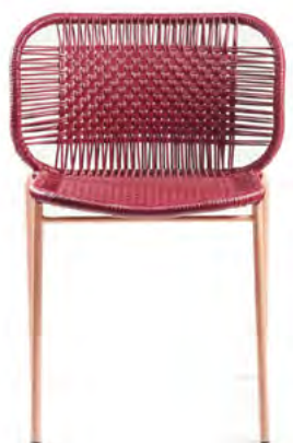
red/pink sand 00ACSC-5