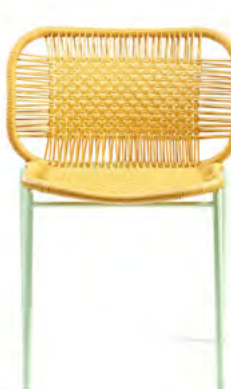
honey yellow/pastel green 00ACSC-6