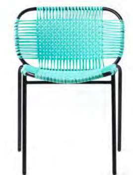
light green/black 00ACSC-2