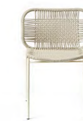
winter grey/pearl white 00ACSC-7