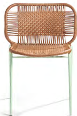
caramel brown/pastel green 00ACSC-7