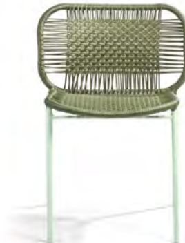
olive green/pastel green 00ACSC-4